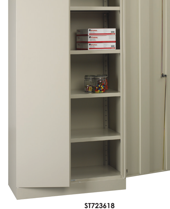
5-Shelf Locking Storage Cabinet 4 adjustable shelves 36"W x 18"D x 72"H