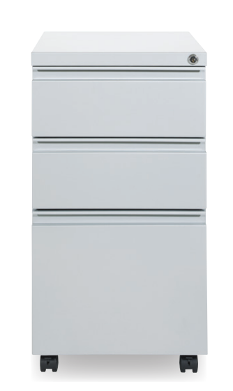
PTC22BBF 22" Deep Mobile Box/Box/File Pedestal 14.75"W x 21.75"D x 28.25"H