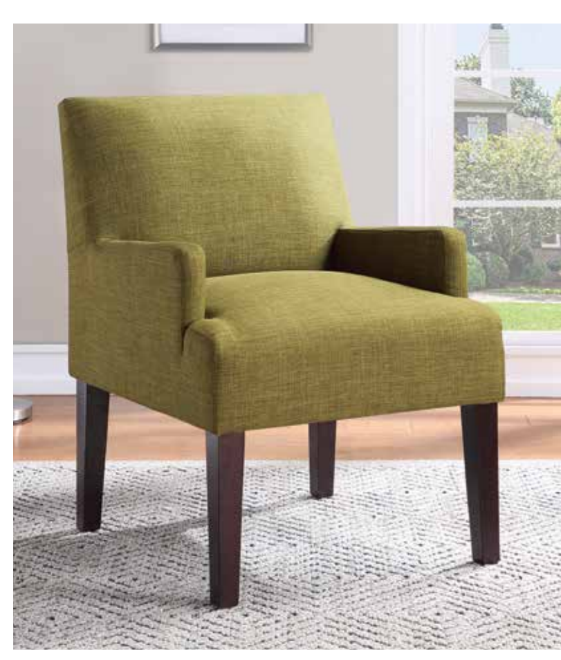
MST55-M17 Main Street Guest Chair Green